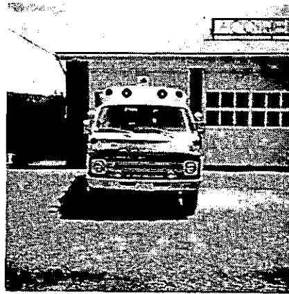
New ambulance at Accident, Maryland, as part of the Northern Garrett County Rescue Squad.

years, the Northern Garrett County Rescue Squad is answering the need of its community through the efforts of dedicated volunteers who will continue to serve their fellowmen as long as they are in trouble and in need of assistance.