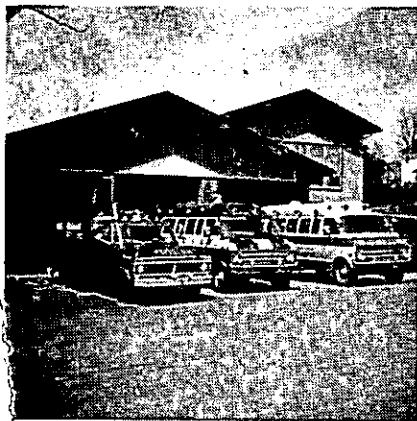
Shows fleet of vehicles of the Northern Garrett Co. Rescue Squad, at Grantsville, Maryland.