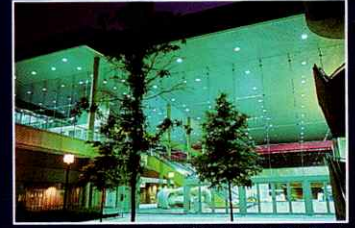
Baltimore Convention Center