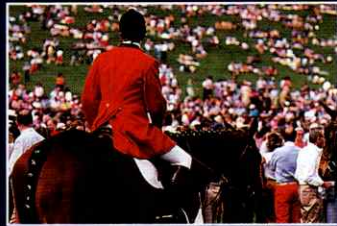
The Hunt Cup

NEW EDITION OF A CLASSIC "BALTIMORE A PORTRAIT" NEW COVER NEW PHOTOS NEW STADIUM AND MORE... NEW ISBN# 0-911897-23-2