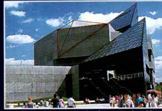
National Aquarium in Baltimore