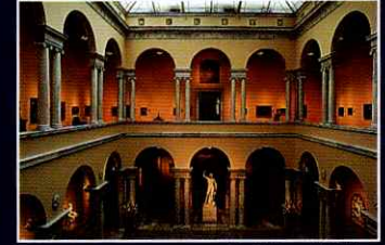
The Walters Art Gallery