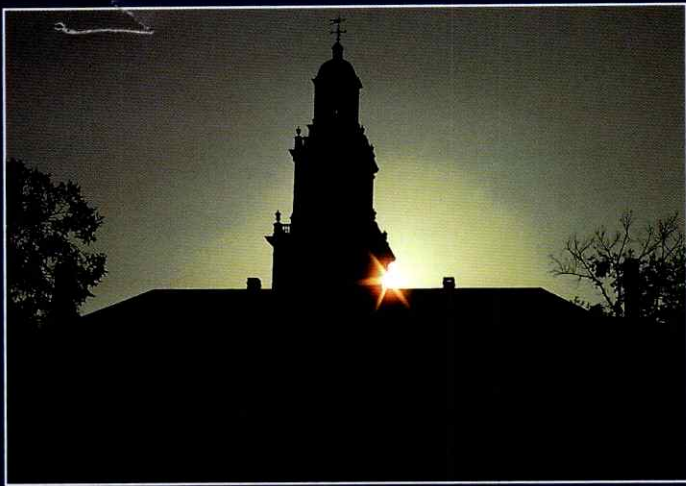
The Johns Hopkins University