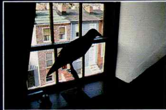
Edgar Allen Poe House