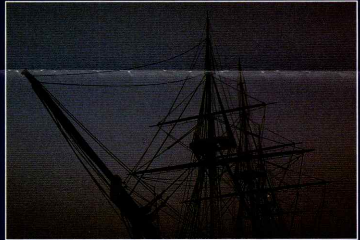
U.S. Frigate Constellation