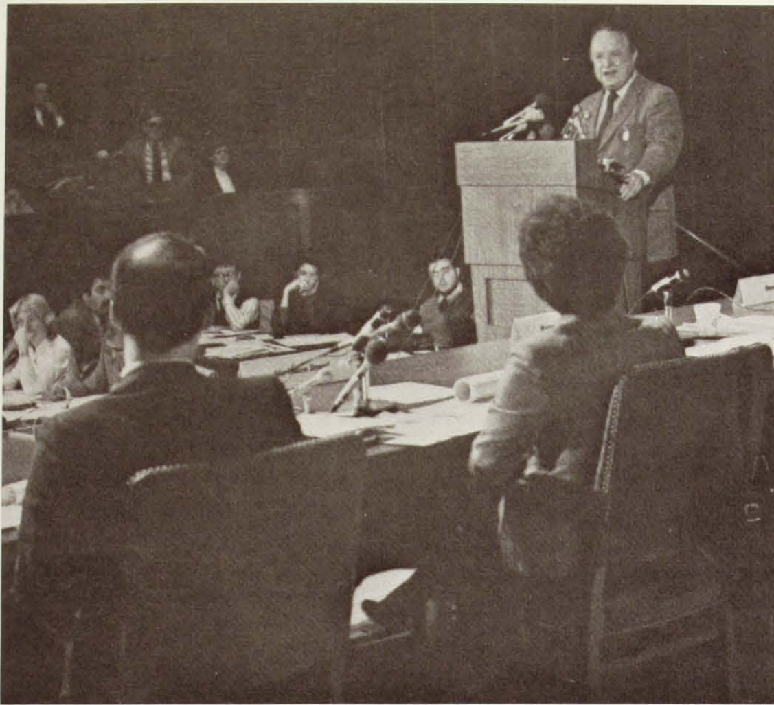
Dr. R Adams Cowley testifies in favor of air bags or automatic seat belts at the United States Department of Transportation hearing on automatic restraints.