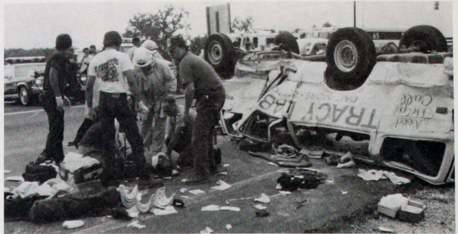
Treating a victim from the crushed, overturned minibus.