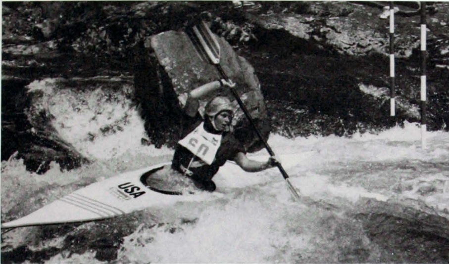
Catherine Hearn-Haller competes in the Savage River Invitational White Water Races.