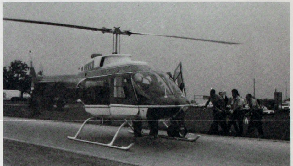
A patient is readied for transport by U.S. Park Police helicopter.